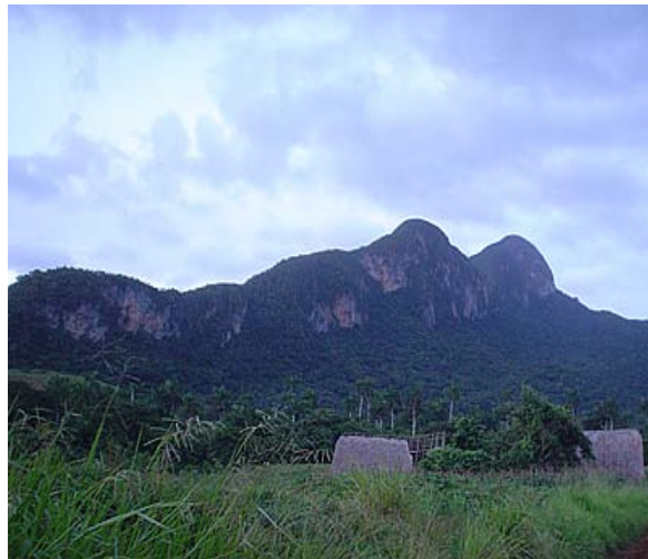
View of Pan de Guajaibón in Pinar del Rio Province, Cuba