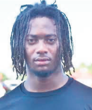
Marcus Woodley Homestead