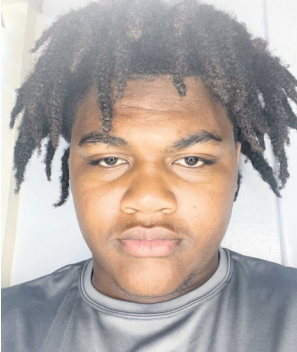
Joshua Townsend Homestead