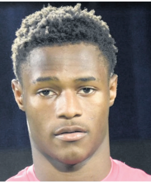
Richard Dandridge Homestead