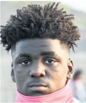
Isaac Brown Homestead