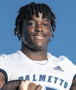
Willis McGahee Palmetto