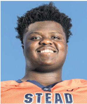
Jameel Carter Homestead