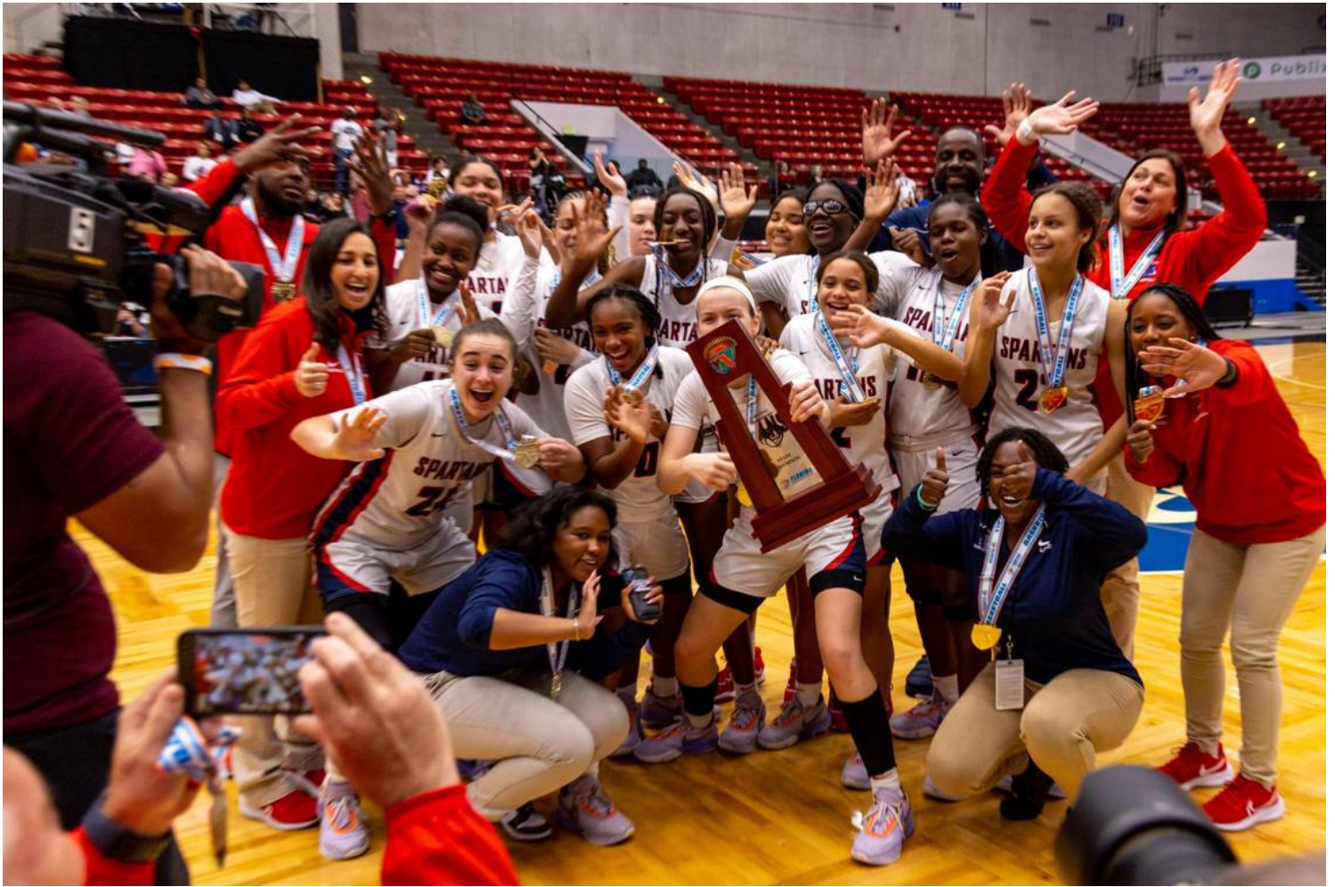
Miami Country Day players react with the first place trophy after defeating Cardinal Mooney 54-38 during the Class 3A state Girls' basketball championship game at RP Funding Center in Lakeland, Florida, on Saturday, February 25, 2023.