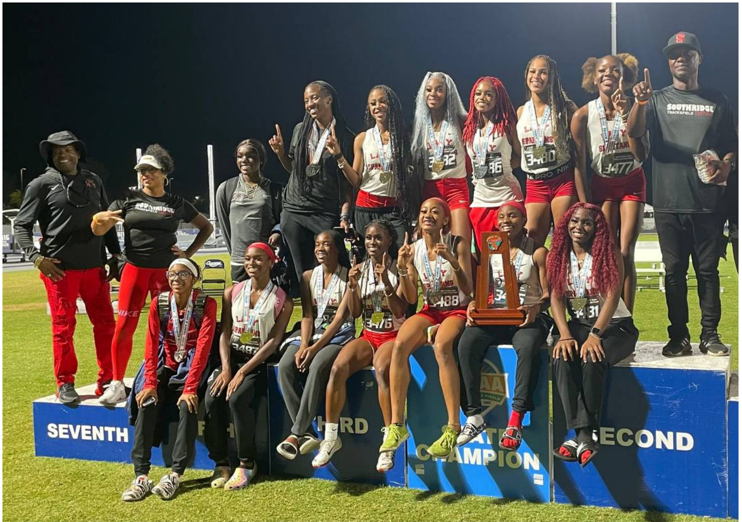
Miami Southridge's girls' track and field athletes and coaches celebrate after winning the Class 4A state championship on Saturday night at the University of North Florida in Jacksonville, Fla.