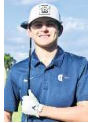
John Marshall Gulliver Prep