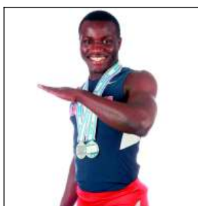
WISDOM OFFOR American