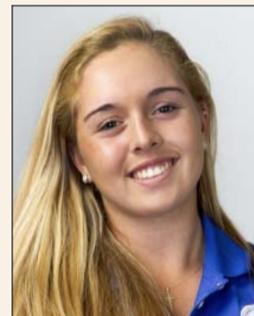
MICHELLE RODRIGUEZ Gulliver